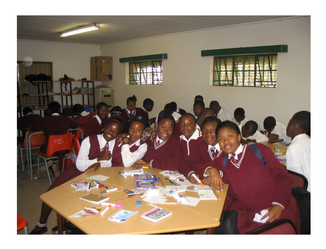
TMTTR Outreach Project - Mamelodi Township, S. Africa