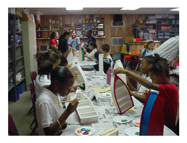
TMTTR Outreach Project – Wichita Falls, Texas